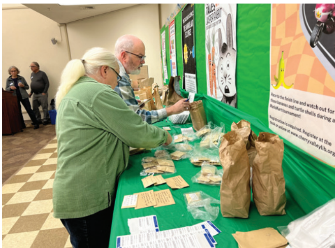
Members Seed Exchange