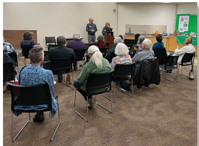
Annual Meeting.