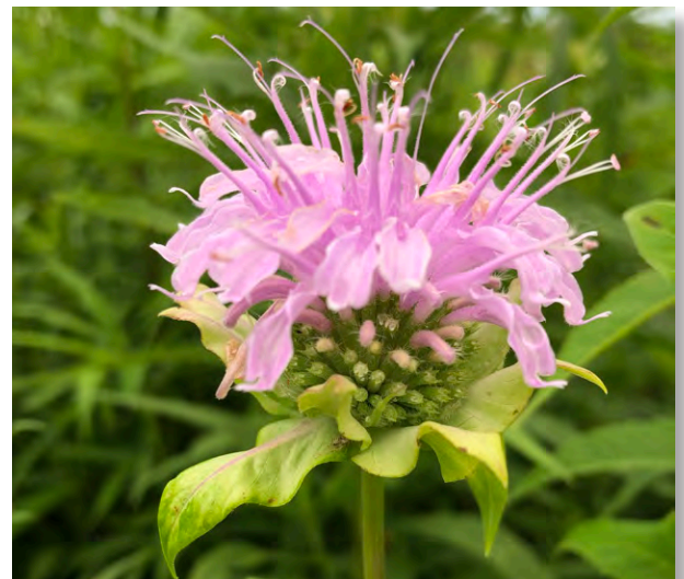
Monarda photo by Jessie Crow Mermel