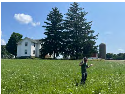
Jared discusses the challenges with weeds like Queen Anne's lace in the prairie restoration at Old Goat Farm.