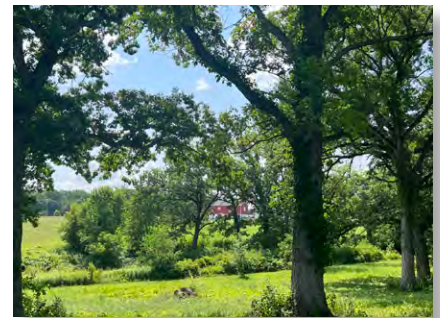
A view of the farm from the 4.5 acres of savanna. The site is being restored through grants from Pheasants Forever and USFWS.