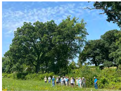
Greg explains the site prep process: hauling trash, cutting invasive trees and shrubs, herbicide application, seeding, mowing, and burning.