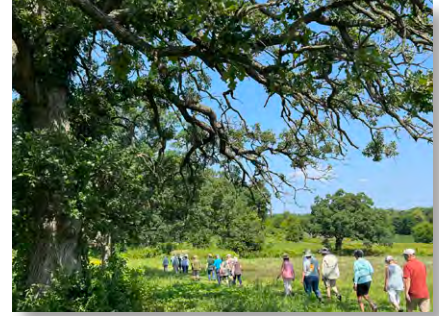
Some of the oaks in the savanna are around 300 years old.