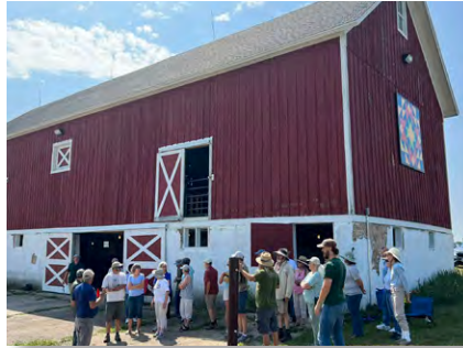
Wild Ones members gather in front of the historic restored barn before heading out for a tour of the land.