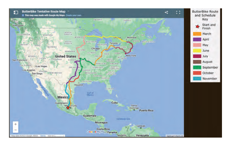
Sara's interactive bicycle map can be found on her website at www.beyondabook.org

Mile after mile, as Sara pedaled, she "looked at the world through the lens of a monarch" and grew increasingly frustrated and angry. In the desire to have well-manicured lawns and mowed roadsides, we have deprived the monarch (and most other pollinators) of their food sources. As mentioned, Sara's true passion is frogs, but she also understands that if "you protect frogs, you protect butterflies" (and vice versa), which helps the whole system maintain its health.