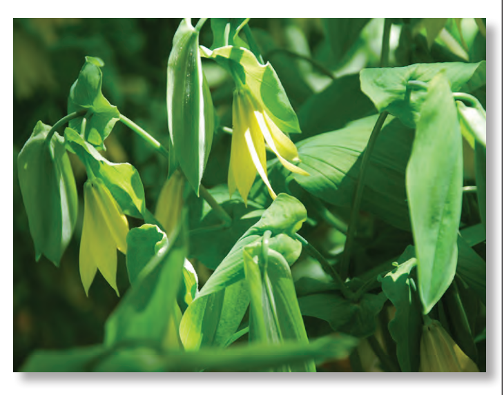
Bellwort photo by Jane Evans.

plant about 1' to 2' tall and is a member of the lily family. It spreads to make nice clumps and blooms early in spring providing food for emerging bees with its yellow blossoms. We will have bellwort and other woodland plants available at the plant sale.