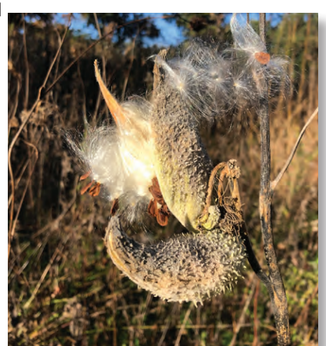
Milkweed pods.

Most of us can't ride 10,000 miles to educate people about monarch butterflies, but we can do what we can to provide food and habitat for butterflies and other pollinators in our yards.